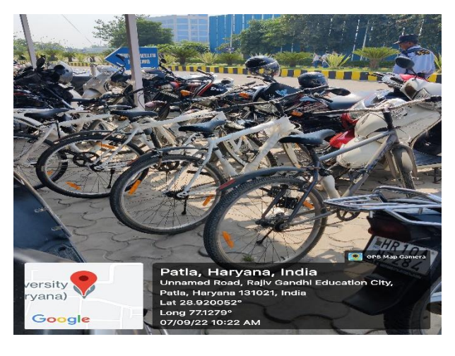
CYCLES IN CAMPUS