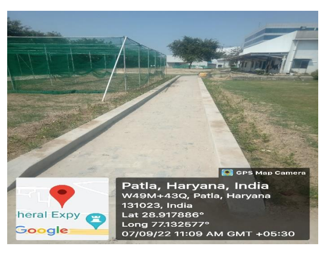
PEDESTRIAN-FRIENDLY PATHWAY PEDESTRIAN-FRIENDLY PATHWAY SRM UNIVERSITY DELHI-NCR, SONEPAT

Established under Haryana Private Universities Act 2006 as amended by Act no.8 of 2013 and recognized by UGC u/s 2(f) of UGC Act, 1956