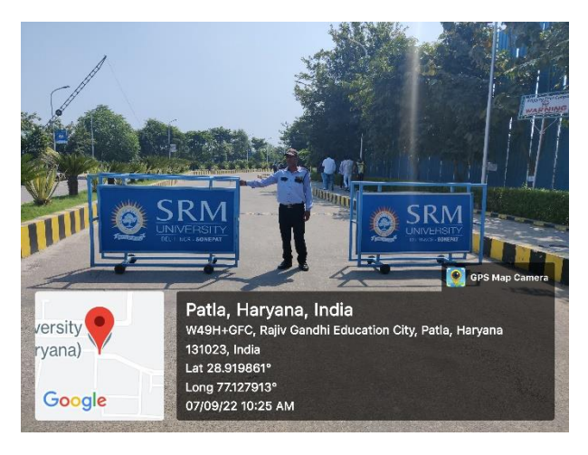
RESTRICTED ENTRY FOR VEHICLES