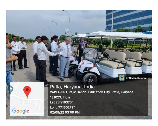
E-VEHICLES FOR FACULTY AND STUDENTS